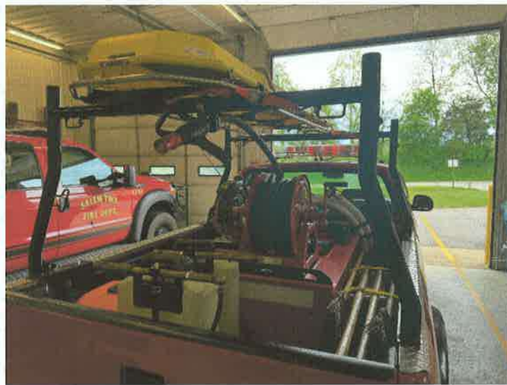
New Skid Unit- Pump/tank in 1731 with a ladder rack to carry the Stokes Basket.

Salem Township Fire Department has a dedicate group of personnel that respond from home and work to help keep the residents of Salem Township and the surrounding communities safe.