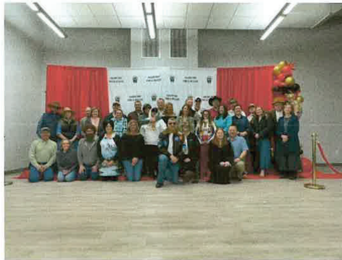
2025 Firefighters Dinner- Movie Couples Theme

Salem Township Fire Department has a dedicate group of personnel that respond from home and work to help keep the residents of Salem Township and the surrounding communities safe.