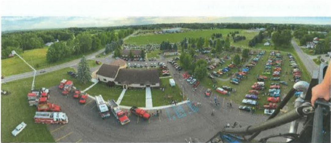
2024 Cruise in For Kids Burn Camp